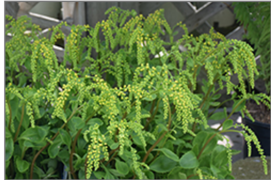
Solar Yellow Lamb's Tail flowers