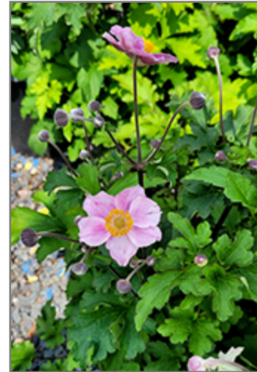
Pink Saucer Anemone flowers

Pink Saucer Anemone is recommended for the following landscape applications;