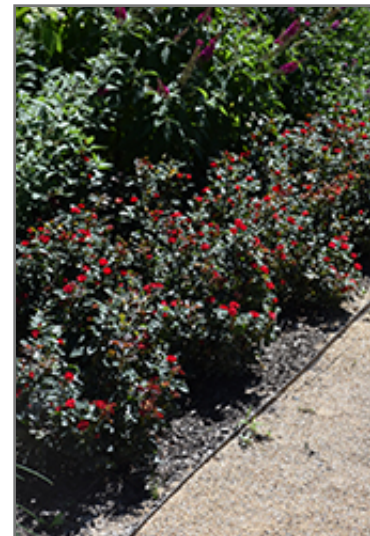
Petite Knock Out Rose in bloom