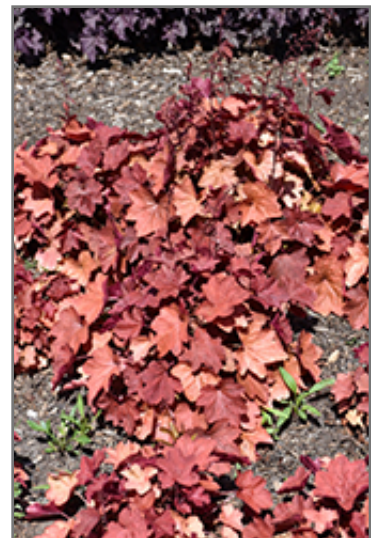
Carnival Cinnamon Stick Coral Bells