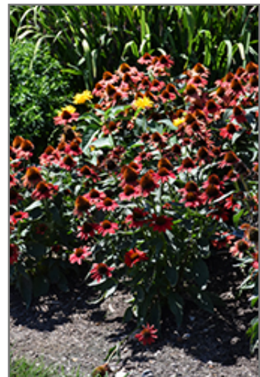
Color Coded Frankly Scarlet Coneflower in bloom