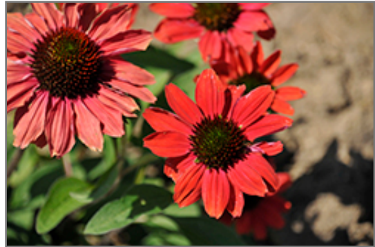
Color Coded Frankly Scarlet Coneflower flowers

Color Coded Frankly Scarlet Coneflower is a fine choice for the garden, but it is also a good selection for planting in outdoor pots and containers. With its upright habit of growth, it is best suited for use as a 'thriller' in the 'spiller-thriller-filler' container combination; plant it near the center of the pot, surrounded by smaller plants and those that spill over the edges. It is even sizeable enough that it can be grown alone in a suitable container. Note that when growing plants in outdoor containers and baskets, they may require more frequent waterings than they would in the yard or garden.