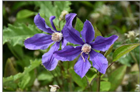
Rain Dance Clematis flowers

Rain Dance Clematis is recommended for the following landscape applications;