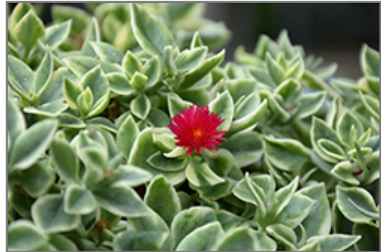
Variegated Baby Sun Rose flowers

Variegated Baby Sun Rose is recommended for the following landscape applications;