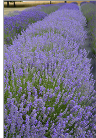
W.K. Doyle Lavender in bloom

W.K. Doyle Lavender is recommended for the following landscape applications;