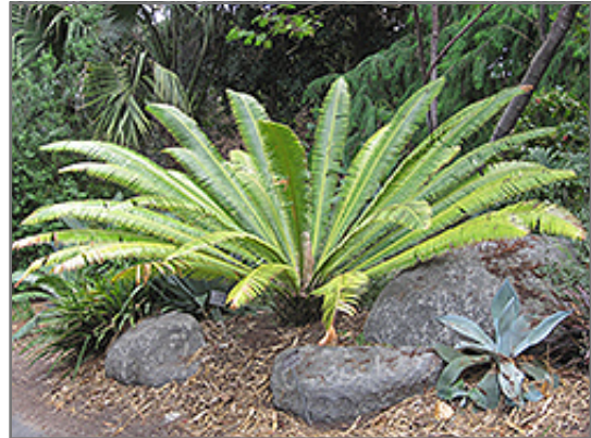
Meja's Dioon

Meja's Dioon is recommended for the following landscape applications;