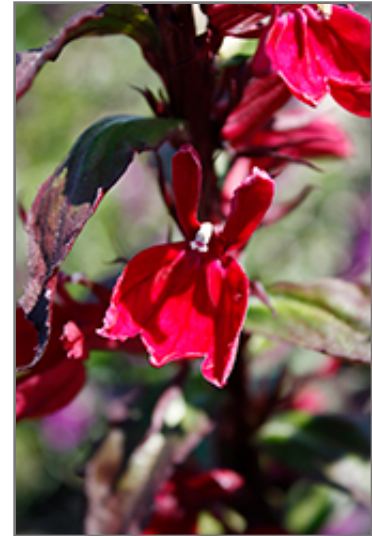
Starship Burgundy Lobelia flowers

Starship Burgundy Lobelia is recommended for the following landscape applications;