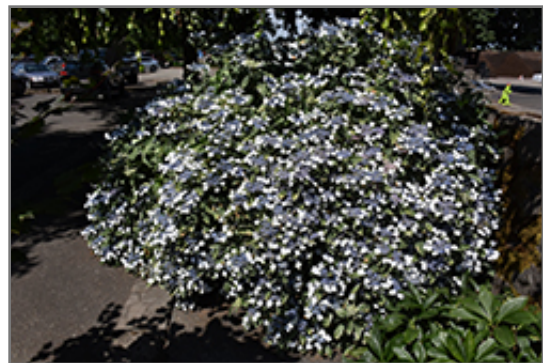
Variegated Bigleaf Hydrangea in bloom