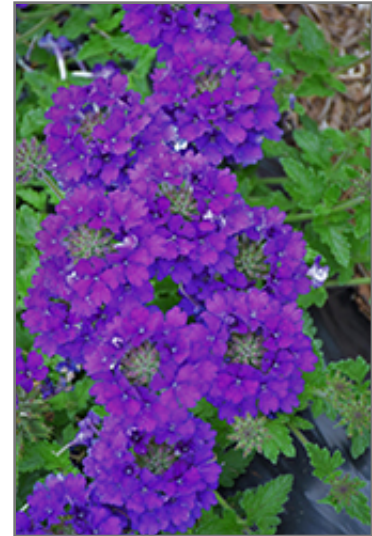
Samira Deep Blue Verbena flowers

Samira Deep Blue Verbena is recommended for the following landscape applications;