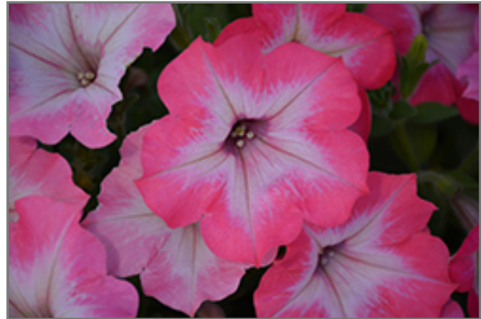
BigDeal Salmon Shimmer Petunia flowers

BigDeal Salmon Shimmer Petunia is recommended for the following landscape applications;