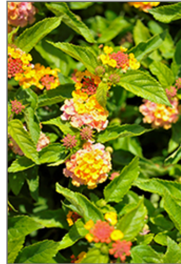
Gem Compact Rose Quartz Lantana flowers

Gem Compact Rose Quartz Lantana is recommended for the following landscape applications;