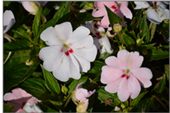
SunStanding Spot On Pink Blush Impatiens flowers

SunStanding Spot On Pink Blush Impatiens is recommended for the following landscape applications;