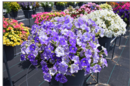
FlashForward Sky Blue Petunia in bloom