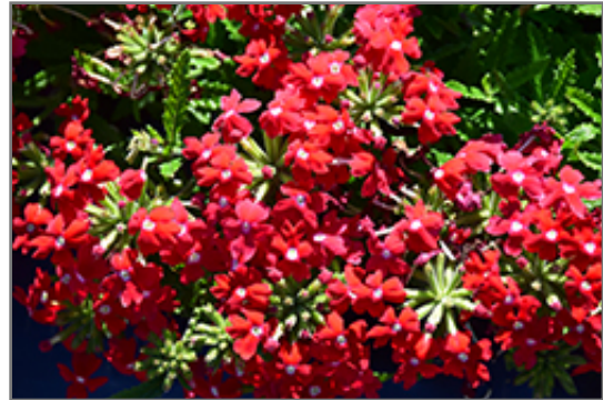
Obsession Cascade Red with Eye flowers

This plant will require occasional maintenance and upkeep. Trim off the flower heads after they fade and die to encourage more blooms late into the season. It is a good choice for attracting bees and butterflies to your yard, but is not particularly attractive to deer who tend to leave it alone in favor of tastier treats. It has no significant negative characteristics.