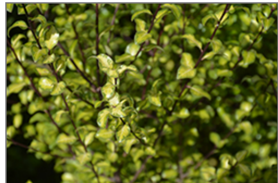
Harley Botanica Kohuhu foliage