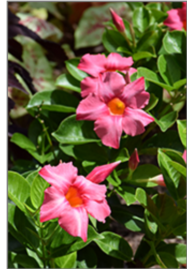
Madinia Coral Pink Mandevilla flowers

This tropical plant does best in full sun to partial shade. It requires an evenly moist well-drained soil for optimal growth. It is not particular as to soil type or pH. It is highly tolerant of urban pollution and will even thrive in inner city environments. This particular variety is an interspecific hybrid, and parts of it are known to be toxic to humans and animals, so care should be exercised in planting it around children and pets. It can be propagated by cuttings; however, as a cultivated variety, be aware that it may be subject to certain restrictions or prohibitions on propagation.