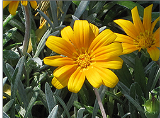
Orange Trailing Gazania flowers

Orange Trailing Gazania is recommended for the following landscape applications;