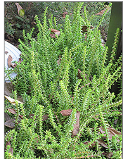
Watch Chain Crassula