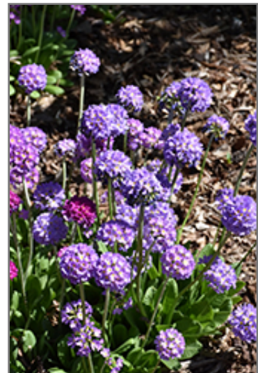
Drumstick Primrose in bloom