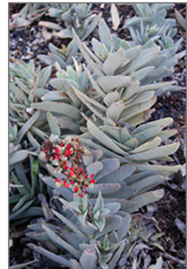
Airplane Plant in bloom