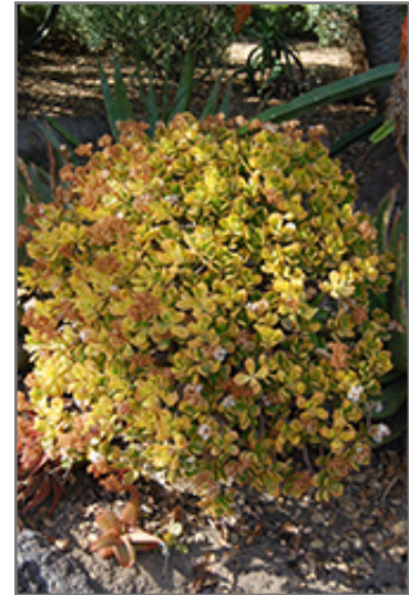
Hummel's Sunset Golden Jade Plant in bloom

Hummel's Sunset Golden Jade Plant is a multi-stemmed evergreen shrub with an upright spreading habit of growth. Its average texture blends into the landscape, but can be balanced by one or two finer or coarser trees or shrubs for an effective composition.