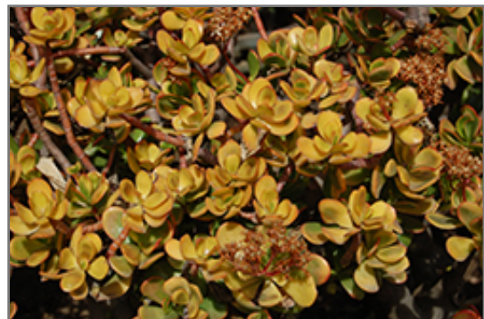
Hummel's Sunset Golden Jade Plant foliage