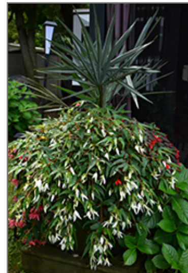
Summerwings White Begonia in bloom