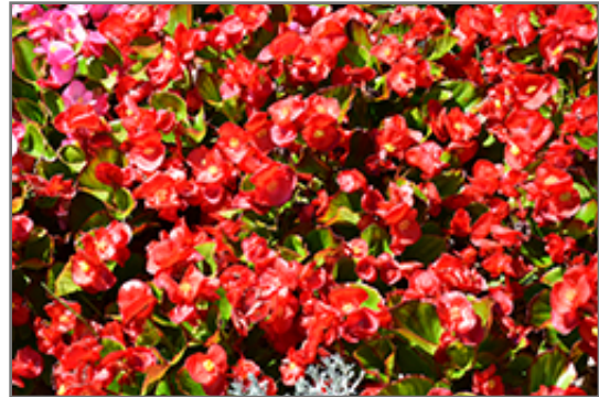
Sprint Plus Red Begonia flowers

Sprint Plus Red Begonia is a fine choice for the garden, but it is also a good selection for planting in outdoor containers and hanging baskets. It is often used as a 'filler' in the 'spiller-thriller-filler' container combination, providing a mass of flowers against which the thriller plants stand out. Note that when growing plants in outdoor containers and baskets, they may require more frequent waterings than they would in the yard or garden.