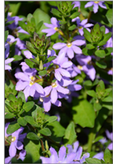
Scampi Blue Fan Flower flowers