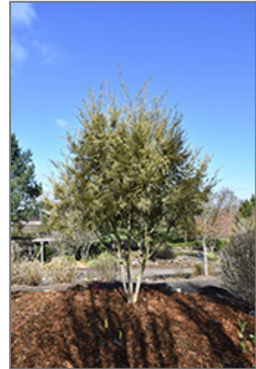
Variegated Box-Leaf Azara

Variegated Box-Leaf Azara is recommended for the following landscape applications;