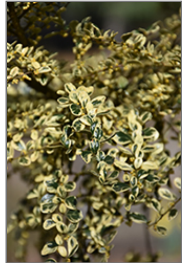
Variegated Box-Leaf Azara foliage

This shrub does best in full sun to partial shade. It does best in average to evenly moist conditions, but will not tolerate standing water. It is not particular as to soil type or pH. It is somewhat tolerant of urban pollution. Consider applying a thick mulch around the root zone in winter to protect it in exposed locations or colder microclimates. This is a selected variety of a species not originally from North America.