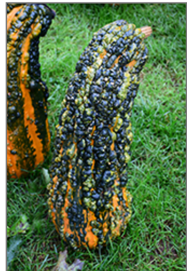
Lunch Lady Gourd fruit