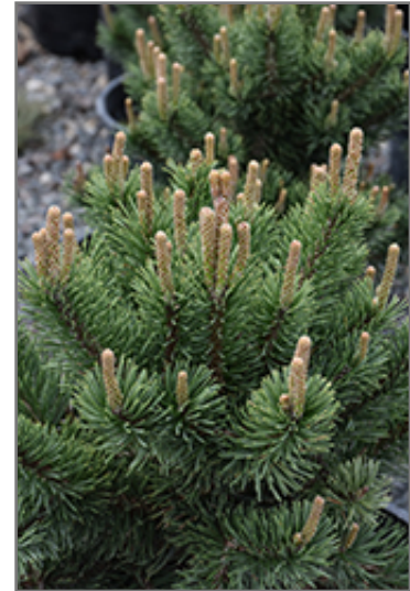
Lakeview Mugo Pine foliage