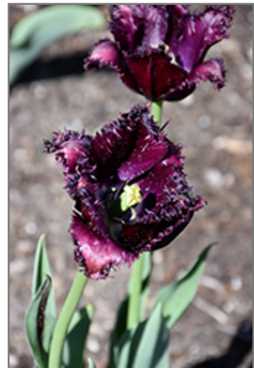
Black Parrot Tulip flowers