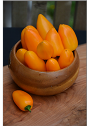
Lunchbox Yellow Sweet Pepper fruit

Lunchbox Yellow Sweet Pepper will grow to be about 3 feet tall at maturity, with a spread of 18 inches. When planted in rows, individual plants should be spaced approximately 18 inches apart. This vegetable plant is an annual, which means that it will grow for one season in your garden and then die after producing a crop.