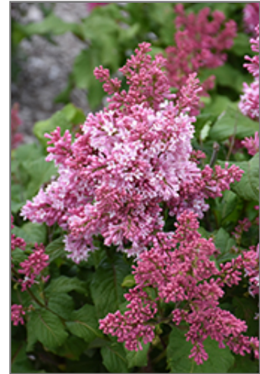
Pinktini Lilac flowers