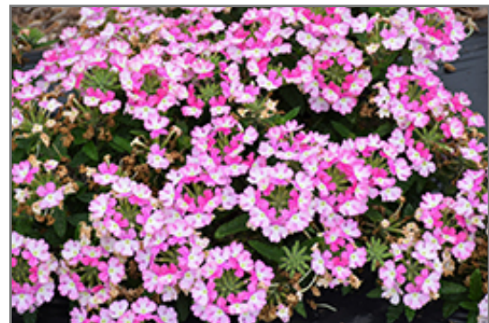
Vanessa Bicolor Pink Verbena flowers