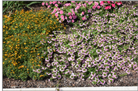
Surdiva Classic Pink Fan Flower flowers

Surdiva Classic Pink Fan Flower is a fine choice for the garden, but it is also a good selection for planting in outdoor containers and hanging baskets. Because of its trailing habit of growth, it is ideally suited for use as a 'spiller' in the 'spiller-thriller-filler' container combination; plant it near the edges where it can spill gracefully over the pot. Note that when growing plants in outdoor containers and baskets, they may require more frequent waterings than they would in the yard or garden.