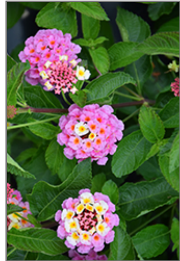
Landscape Bandana Pink Lantana flowers

Landscape Bandana Pink Lantana is recommended for the following landscape applications;