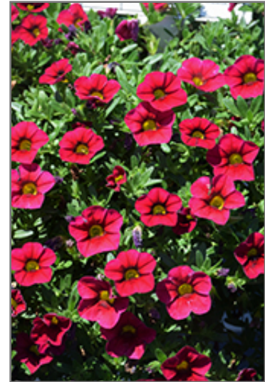
Lia Dark Red Calibrachoa flowers

Lia Dark Red Calibrachoa is recommended for the following landscape applications;