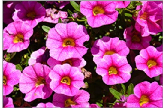
Colibri Pink Lace Calibrachoa flowers

Colibri Pink Lace Calibrachoa is recommended for the following landscape applications;