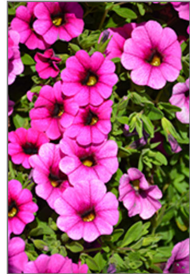
Colibri Pink Calibrachoa flowers

Colibri Pink Calibrachoa is a dense herbaceous annual with a mounded form. Its medium texture blends into the garden, but can always be balanced by a couple of finer or coarser plants for an effective composition.