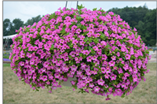
Chameleon Pink Diamond Calibrachoa in bloom

Chameleon Pink Diamond Calibrachoa is a fine choice for the garden, but it is also a good selection for planting in outdoor containers and hanging baskets. Because of its trailing habit of growth, it is ideally suited for use as a 'spiller' in the 'spiller-thriller-filler' container combination; plant it near the edges where it can spill gracefully over the pot. Note that when growing plants in outdoor containers and baskets, they may require more frequent waterings than they would in the yard or garden.