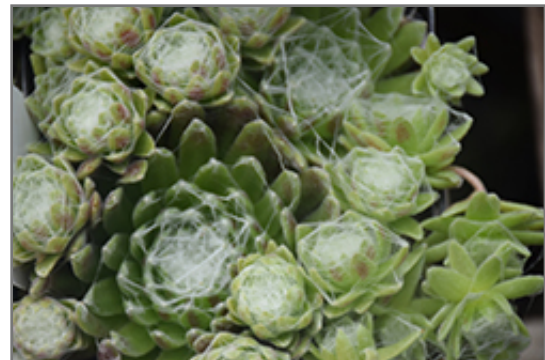
Cobweb Buttons Hens And Chicks