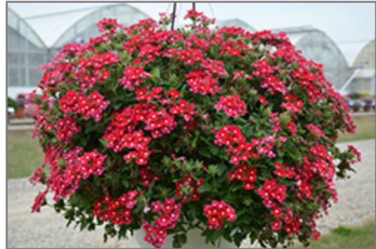
Cadet Upright Red Verbena in bloom

Cadet Upright Red Verbena is a fine choice for the garden, but it is also a good selection for planting in outdoor containers and hanging baskets. It is often used as a 'filler' in the 'spiller-thriller-filler' container combination, providing a mass of flowers against which the larger thriller plants stand out. Note that when growing plants in outdoor containers and baskets, they may require more frequent waterings than they would in the yard or garden.