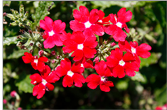
Cadet Upright Red Verbena flowers

Cadet Upright Red Verbena is recommended for the following landscape applications;