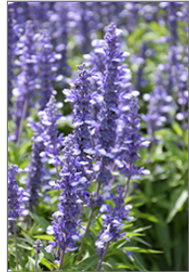
Farina Arctic Blue Salvia flowers

This plant will require occasional maintenance and upkeep, and should be cut back in late fall in preparation for winter. It is a good choice for attracting butterflies and hummingbirds to your yard, but is not particularly attractive to deer who tend to leave it alone in favor of tastier treats. It has no significant negative characteristics.