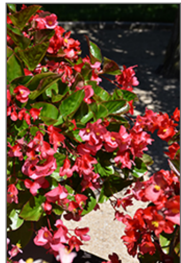
Viking XL Rose on Green Begonia flowers