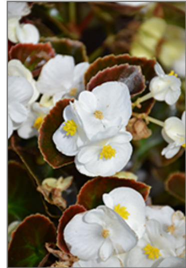
Senator IQ White flowers