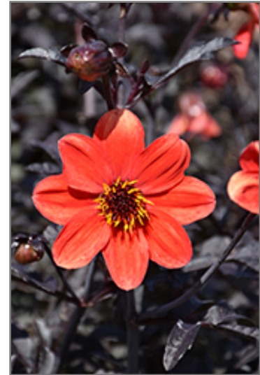
Mystic Enchantment Dahlia flowers

Mystic Enchantment Dahlia is recommended for the following landscape applications;