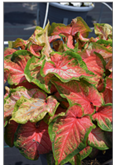
Heart to Heart Chinook Caladium foliage