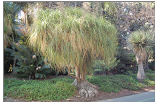
Pony Tail Palm