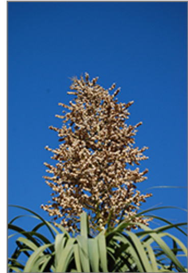
Pony Tail Palm flowers

Pony Tail Palm is a fine choice for the yard, but it is also a good selection for planting in outdoor pots and containers. Because of its height, it is often used as a 'thriller' in the 'spiller-thriller-filler' container combination; plant it near the center of the pot, surrounded by smaller plants and those that spill over the edges. It is even sizeable enough that it can be grown alone in a suitable container. Note that when grown in a container, it may not perform exactly as indicated on the tag - this is to be expected. Also note that when growing plants in outdoor containers and baskets, they may require more frequent waterings than they would in the yard or garden.