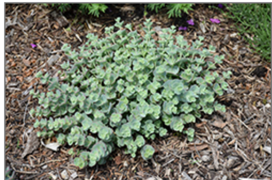
Dwarf October Daphne