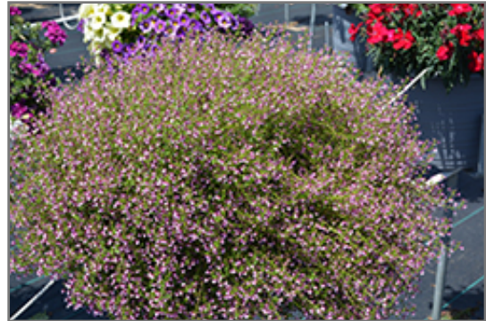
Pink Shimmer Cuphea in bloom

Pink Shimmer Cuphea will grow to be about 16 inches tall at maturity, with a spread of 16 inches. When grown in masses or used as a bedding plant, individual plants should be spaced approximately 12 inches apart. Its foliage tends to remain dense right to the ground, not requiring facer plants in front. Although it's not a true annual, this plant can be expected to behave as an annual in our climate if left outdoors over the winter, usually needing replacement the following year. As such, gardeners should take into consideration that it will perform differently than it would in its native habitat.