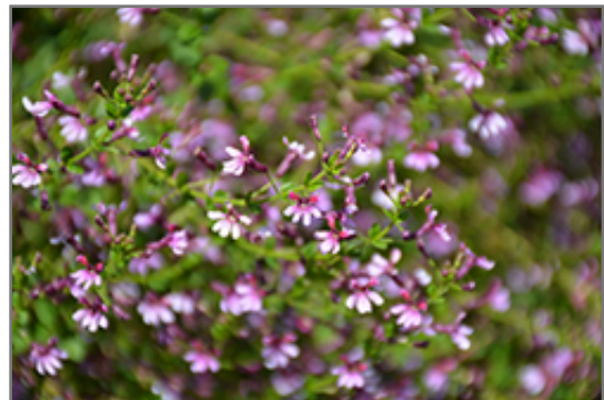
Pink Shimmer Cuphea flowers